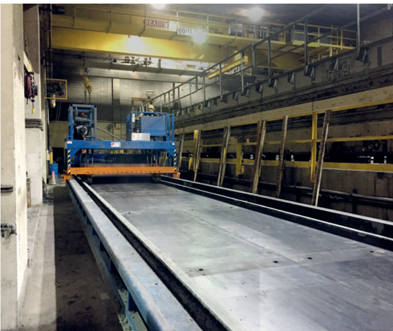
Brush/Oiler/Strand Puller Machine

Other forms supplied for the project included a small bulb tee line and two battery molds used to cast walls. The bulb tee side forms are installed on a roll back system, making it easy and again, eliminating the use of a crane to move the side forms for set-up and stripping. The battery molds are in-