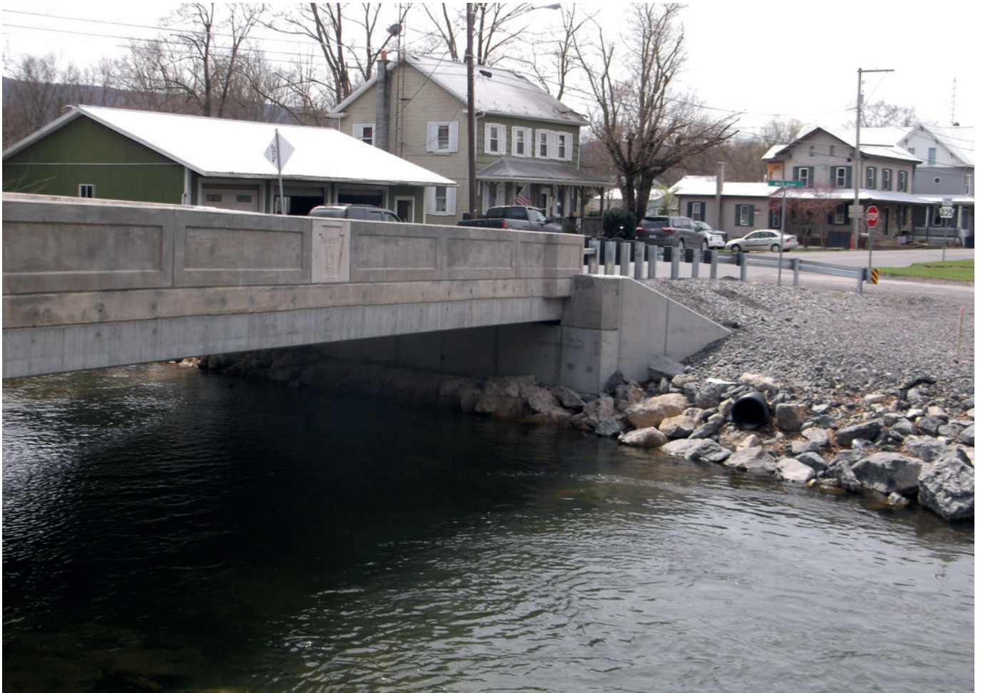
Bridge 184 after replacement

Hamilton Form Company, Ltd 7009 Midway Rd., Fort Worth, TX 76118, USA T +1 817 590 2111 sales@hamiltonform.com www.hamiltonform.com